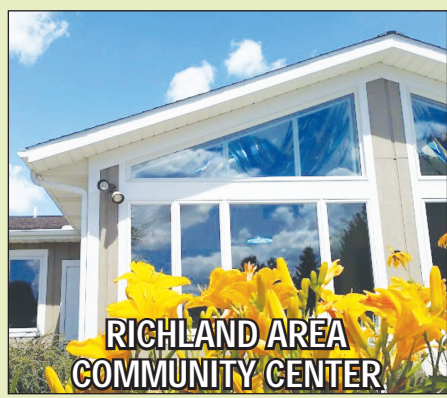
RICHLAND AREA COMMUNITY CENTER

9400 East CD Ave. Richland, Michigan 49083 (269) 629-9430 richlandareacc.org