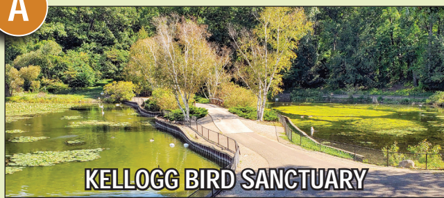
KELLOGG BIRD SANCTUARY

12685 East C Ave. Augusta, Michigan 49012 (269) 671-2510 kbs.msu.edu/visit/birdsanctuary Free entry during tour weekend for Arts and Eats travelers.